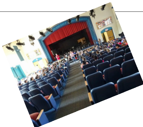
Students, Teachers & Rotarians gather in the auditorium to receive assignments

– Albert Einstein (1879-1955) German-born physicist who developed the general theory of relativity, one of the two pillars of modern physics.